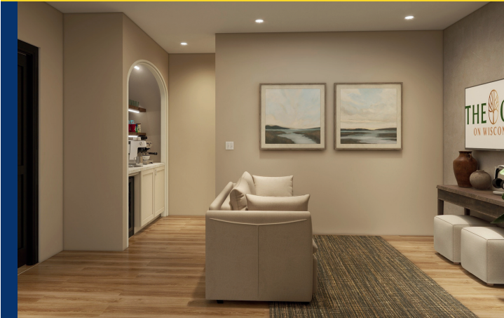
Upstairs Loft with Wet Bar